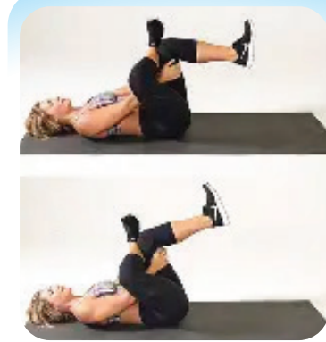
Figure 4/Piriformis Stretch: Cross one ankle over the opposite knee and gently pull the supporting leg towards you.

Thread the Needle Rotation: On hands and knees, slide one arm under the other and rotate gently through the mid back and alternate sides.